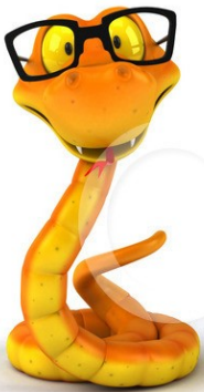
illustrations of.com #227114

Happy October! Get ready for some more fun. This month we will be having fun learning about our 5 senses which is a lot of hands on activities, woohoo! Fire safety week will be an explosion of excitement because I am all about safety and being prepared. We will also have firefighters coming in later in the month to expand on what we learned. I also love the harvest season, learning about fall weather and harvest activities are a frightfully good time.